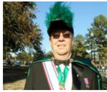
ADM Al Grupy

Raleigh – 778 Cary – 2446 Garner/Fuquay – 2983 Chapel Hill – 3005 Durham – 3365 Henderson – 3440 Wake Forest – 3510 Raleigh -- 3552